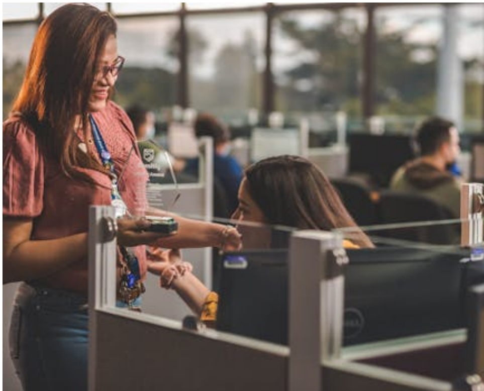
Figure 3: Employee recognition ceremony at Great Pasta