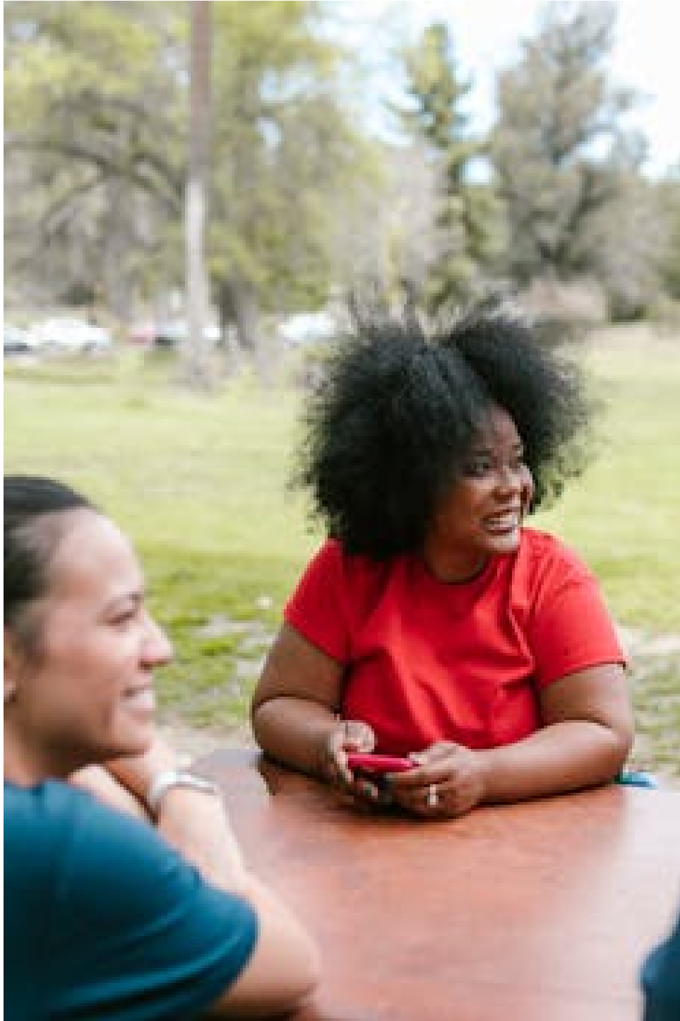
Figure 2: Team-building activities during the annual employee retreat