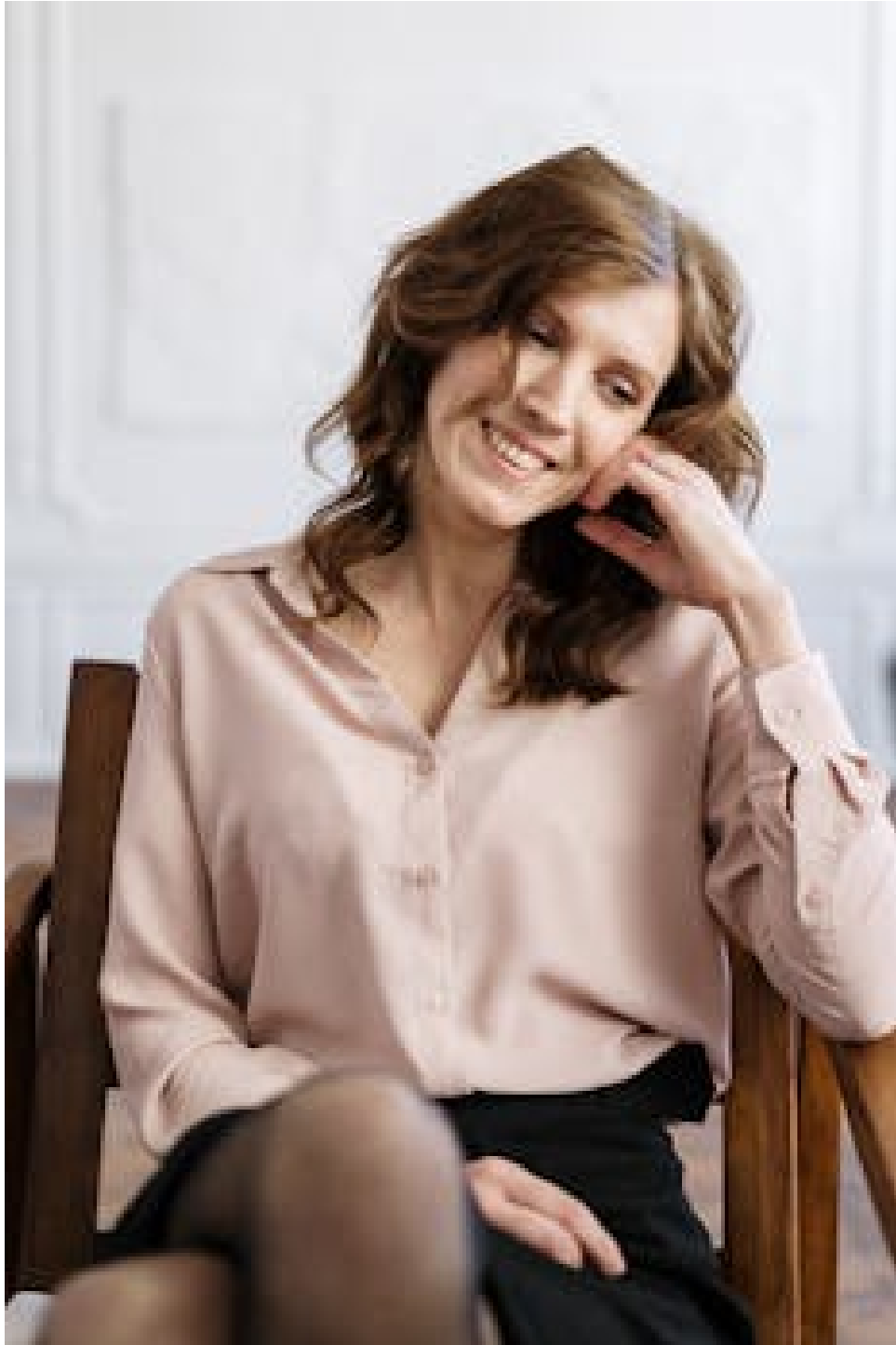
Figure 1: A wellness program in action at Great Pasta